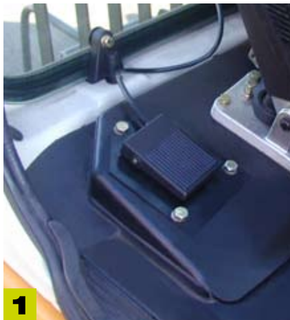
Totalizing option with push button using the machine lever free one