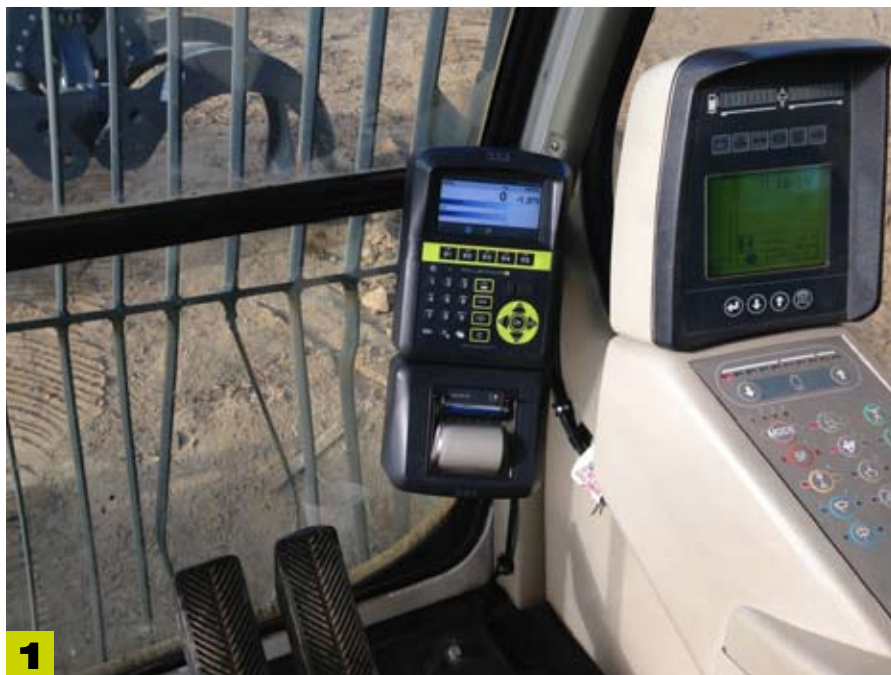
On-board instrumentation millennium5