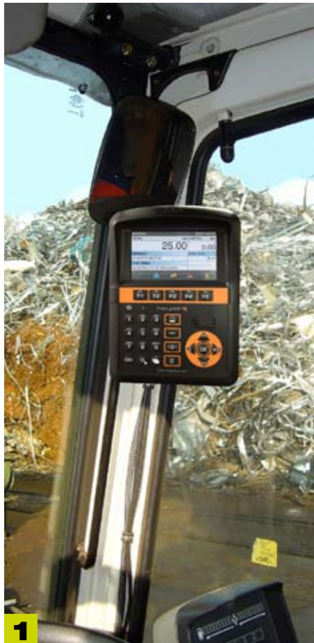
On-board instrumentation helperX