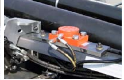
weighing pads bolted on the frame