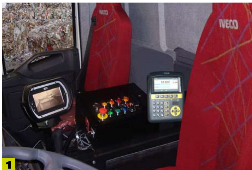
onboard instrumentation millennium5

VEI electronics is a reliable solution proven in the front-end loader application where vibrations and shocks are off limits. With this unique weighing system your collection and billing are under control with no hassles because it allows you to complete the cycle without loss of time and more than everything the Net weight of the waste contained into the bin is the real one. Why? How many times have you been into the problem of entering fixed tares which do not match with the reality because waste remains into the bin after dumping or just because of different manufacturing characteristics between presumably same bins? With VEI weighing concept all this have gone: lifting up you weigh the GROSS while lowering down you weigh the TARE, the result is the real NET weight dumped into the compactor. VEI comes from a long time experience in on board weighing for mining, quarrying, waste, material handling and underground applications.