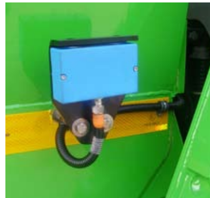
Contactless weighing zone sensor for weight reading