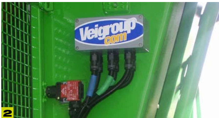
onboard instrumentation helperX