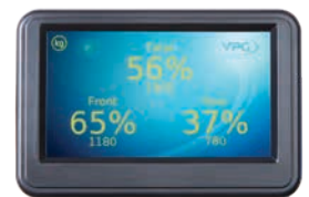
Each Axle Displayed as a Percentage

Airedale House | Canal Road | Bradford BD2 1AG Ph: +44 (0)1274 771177 | Fax: +44 (0)1274 781178 E-mail: obw.eur@vpgsensors.com