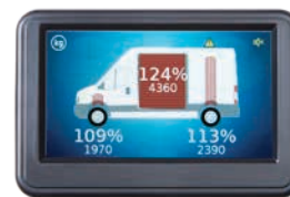
Gross Overload Warning