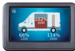
Rear Axle Overload Warning