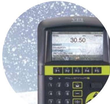
CLIMATIC TEST -40°C ÷ +80°C