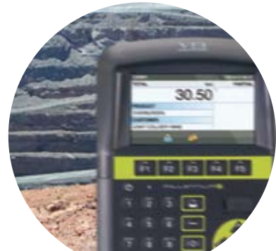
VIBRATION & SHOCK 40G